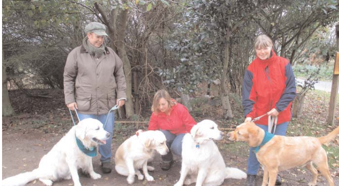
Paws Walk, October, Suffolk