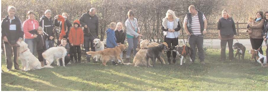
Paws Walk, Timsbury, Bath, October, Somerset

10+ Golden Retrievers were joined by Collies, Westies, Springer Spaniels, a Duck Tolling Retriever, a Vizsla and others in the walk down the beach to the waterfront - bringing and leaving with joy. At the end of the race refreshments were taken at the café and we raised £121 on the day!