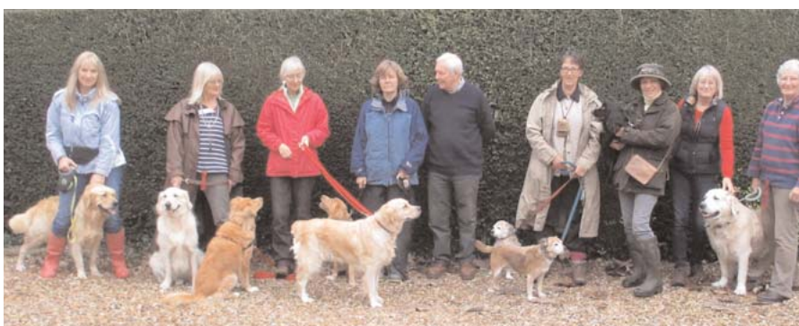
Paws Walk, 15th October, Dorset

Paws for a Walk is a series of annual sponsored walks which help raise the funds we desperately need to enable us to continue saving golden lives