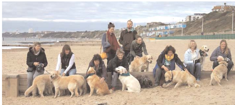
Paws Walk, Hengtisbury Head, October, Dorset